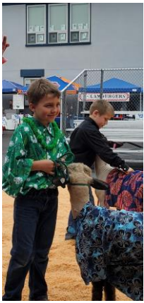
Beautiful lamb Classes - 2022