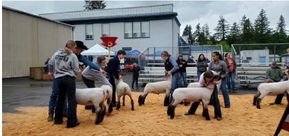
Market Lamb Classes - 2022