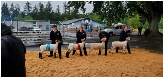
FFA Showmanship 2022

http://marioncountylambandwoolshow.yolasite.com