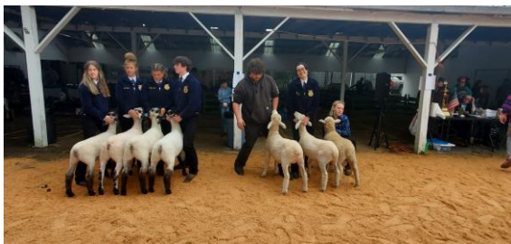
FFA Chapters 2022

CITY OF TURNER COASTAL FARM STORE COUGAR MOUNTAIN CONSTRUCTION