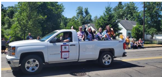
Court and Grand Marshal 2022

CITY OF TURNER BEHTEL EXCAVATING COUGAR MOUNTAIN CONSTRUCTION RIVER BEND MATERIALS TREE LINE TRANSPORTATION