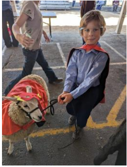
Beautiful lamb Classes - 2023