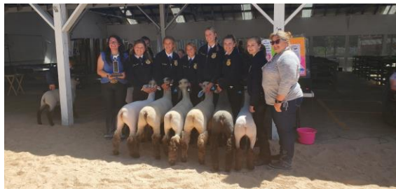
FFA Best Chapter 2023

http://marioncountylambandwoolshow.yolasite.com