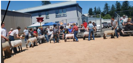
Market Lamb Classes - 2023