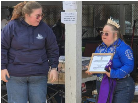
Grand Marshal 2026