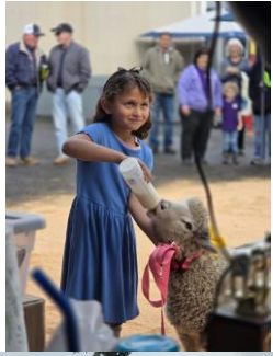
Beautiful lamb Class - 2026