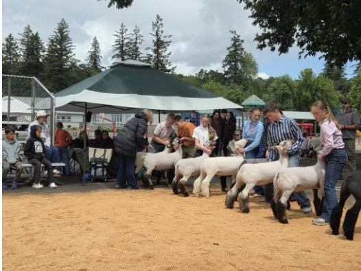
Market Lamb Classes - 2026