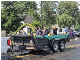
Court in parade 2026